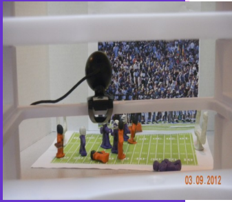
Inside the Football game from an FPS BBB's project.

BB&B is a technology class offered as an elective here at Furtah. In it, students cover stop-motion animated movie making through brick films and clay-mation. A Brick Film is an animated film that uses LEGO® characters and pieces (as well as other manipulatives) to tell a story. Using cameras, animation software, and video editing software they create multi-scene movies with transitions, titles, credits, sound effects and narration. The students don't video these movies, they take pictures and animate them. These films are